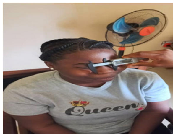
Figure 1: Diagram showing the measurement of the nasal width.

Data obtained were analysed using both descriptive statistics (Mean and Standard deviation) and inferential statistics (t-test) to describe the nature of the data. The statistical analysis was done with the aid of the Statistical Package for Social Science (SPSS version 24.0).