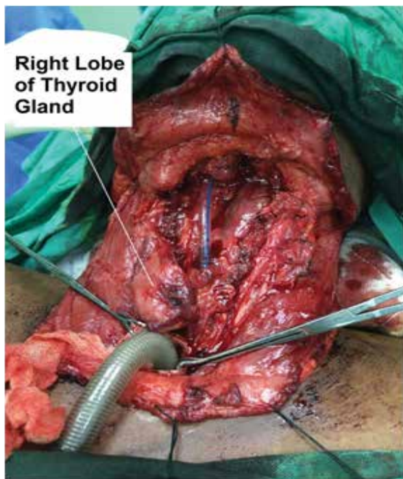
Figure 1: Post total laryngectomy and left hemithyroidectomy

the right posterior border of larynx and right tracheoesophageal groove seen. The right recurrent laryngeal nerve was identified and divided. The preserved thyroid lobe was positioned medial to right sternocleidomastoid muscle (Figure 1). Histopathology report of the laryngectomy specimen (Figure 2) was reported as moderately