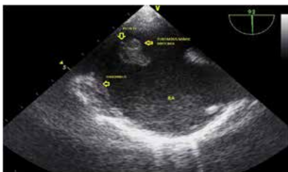
Fig 1: Transesophageal echocardiography (TOE) showed a pedunculated freely mobile mass.

Postoperatively, the patient condition improved markedly. She was able to be extubated on day two post-operative and was able to be discharged on day 10. She received anticoagulation therapy for treatment and prevention of recurrent pulmonary embolism.