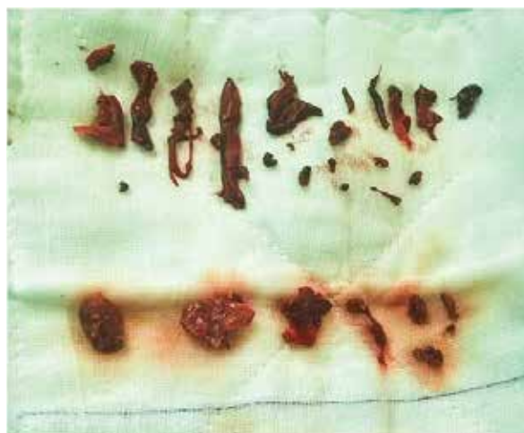
Fig 3: Blood clots removed from patient's pulmonary trunk and right atrium.