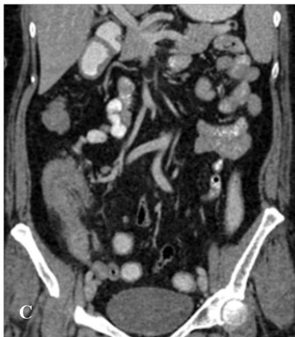
Figure 2c : Claw sign (arrow) suggestive of intussusception.

streakiness surrounding the ceecal pole with multiple subcentimeter mesenteric nodes seen at that region.