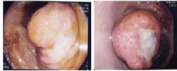
Figure 1: Endoscopic image of huge fungating mass arising from the caecal wall.

On physical examination, her vital signs were stable. Abdominal examination revealed normoactive bowel sounds, non-distended abdomen, and diffuse mild tenderness to palpation. Per rectum findings showed brownish stool but no mass. Proctoscope showed no hemorrhoid or mass. Initial laboratory tests including complete blood count showed low Hemoglobin (Hb) count but was normalized after several blood transfusions. The metabolic investigations were normal. CEA value was 0.7(ng/mL). Colonoscopy revealed huge fungating mass at the caecum (Figure 1). However, the endoscopic biopsy result revealed mild edema with granulation tissue. Even though HPE showed benign features, surgeon decided to take out the lesion since symptoms persisted and there was a possibility that biopsy taken was not at accurate site.