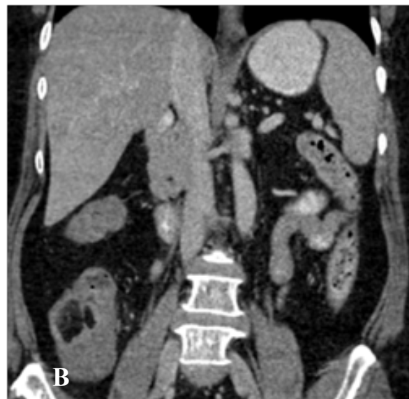
Figure 2a-b: CT Scan showed endoluminal mass with multiple septation arising from lateral wall of caecum.

There was also short segment of intussusception seen proximal to the lesion with evidence of telescoping and claw sign/bowel within bowel sign (Figure 2c). There was no dilated bowel proximally. The appendix was normal. Minimal